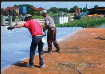
Ship Deck - United States