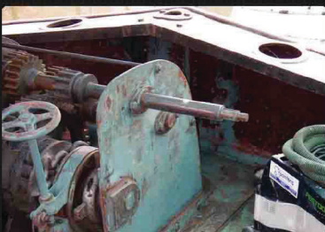
Ship Deck - United States [before]