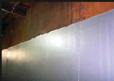
Ship - United States