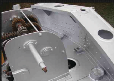
Ship Deck - United States [after]